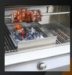
Solid Fuel Insert