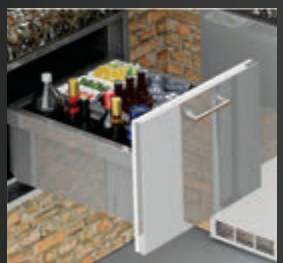
Undercounter Ice Bin