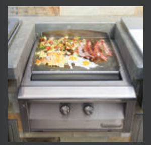
Versa Power Cooker