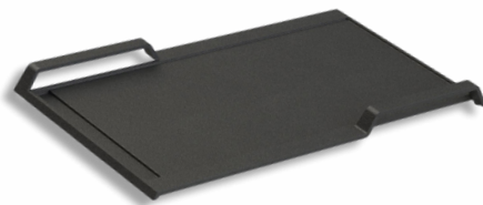
cast iron griddle $669 MSRP LFINDTEP (with induction purchase)