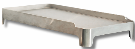
stainless steel griddle $999 MSRP LFTEPSS (with dual fuel purchase)