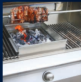
Solid Fuel Insert

SPEND RECEIVE* $6,000 $300 REBATE $9,000 $500 REBATE