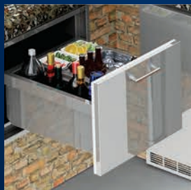
Undercounter Ice Bin