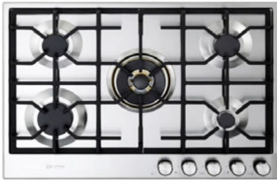
VDGCT530FSS 30" Gas Cooktop