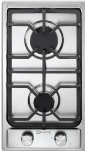
VDGCT212FSS 12" Gas Cooktop