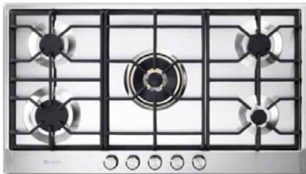
VDGCT536FSS 36" Gas Cooktop