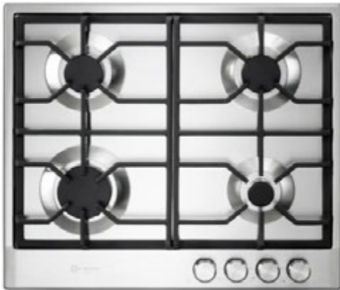
VDGCT424FSS 24" Gas Cooktop